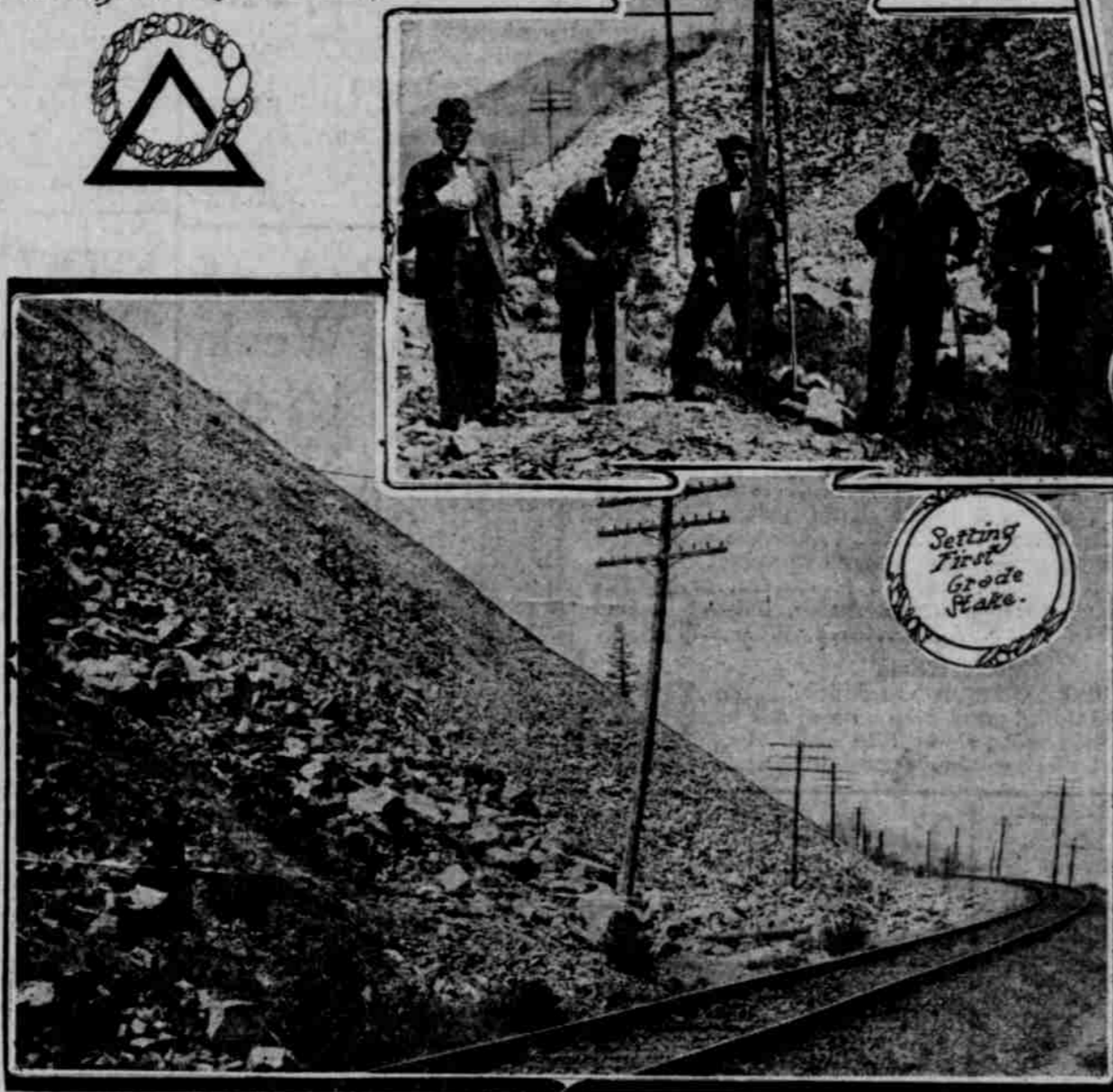
Setting First Grade Stake.

The route of the way around Shell Rock Mountain will parallel the railroad track. A plan was proposed whereby the railroad would move its tracks over the water of the Columbia by means of a trestle. However, because of the depth of the water at this point and the necessary expense that