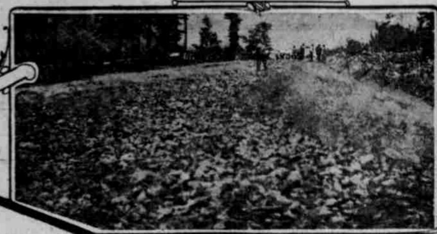
Building Stretch of Road near Wyeth