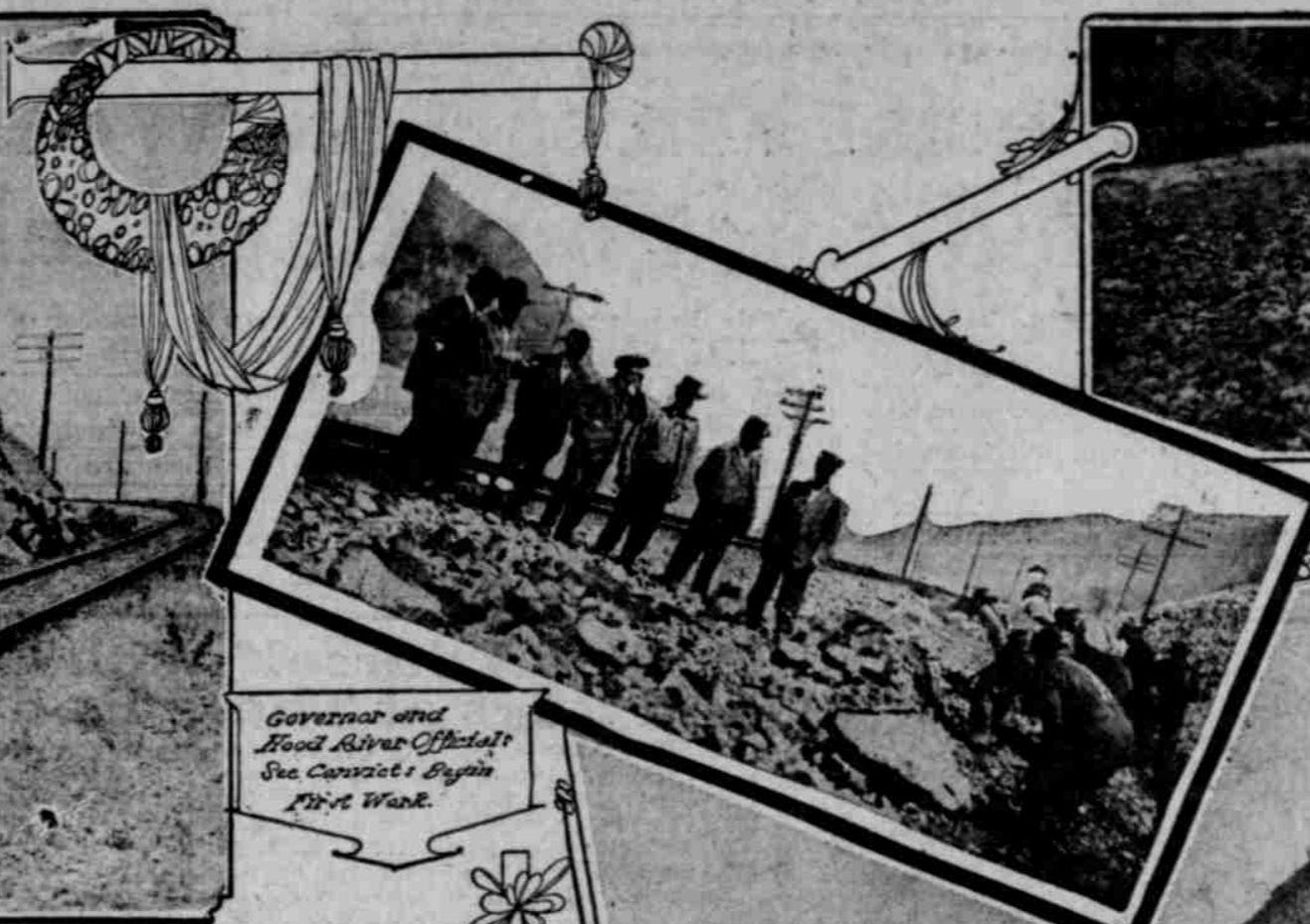
Governor and Hood River Officials See Convicts Begin First Work.