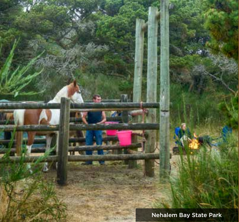
Nehalem Bay State Park