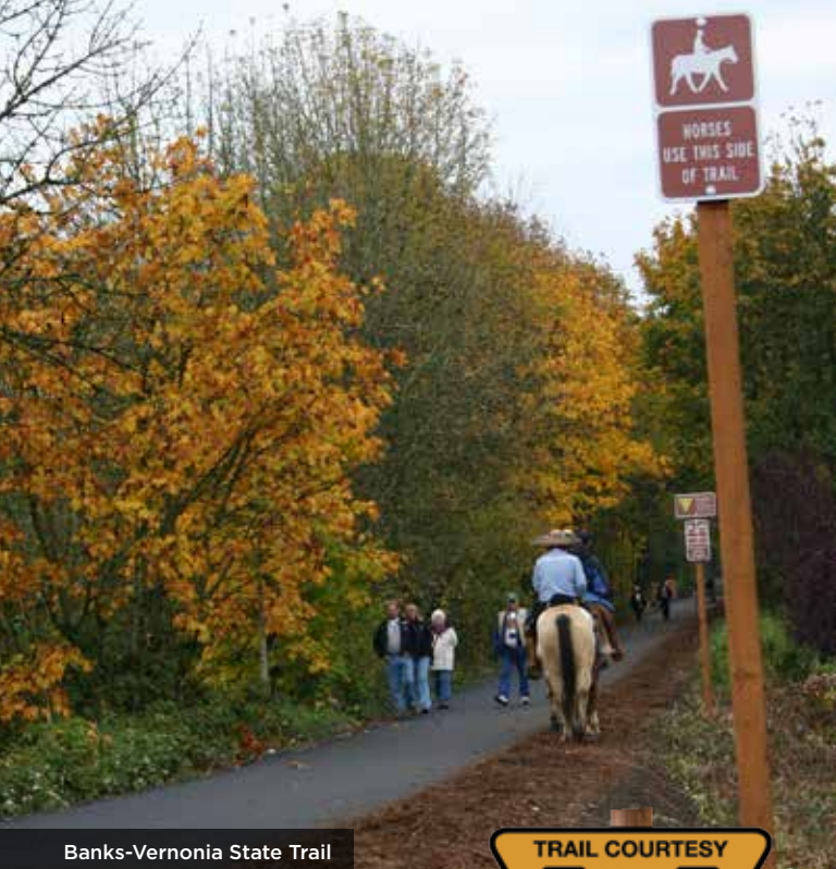
Banks-Vernonia State Trail