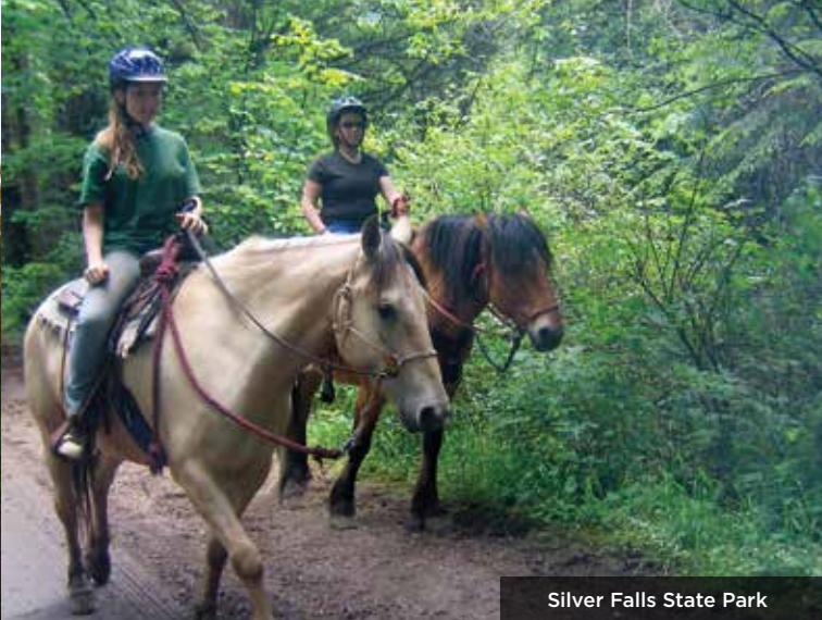
Silver Falls State Park