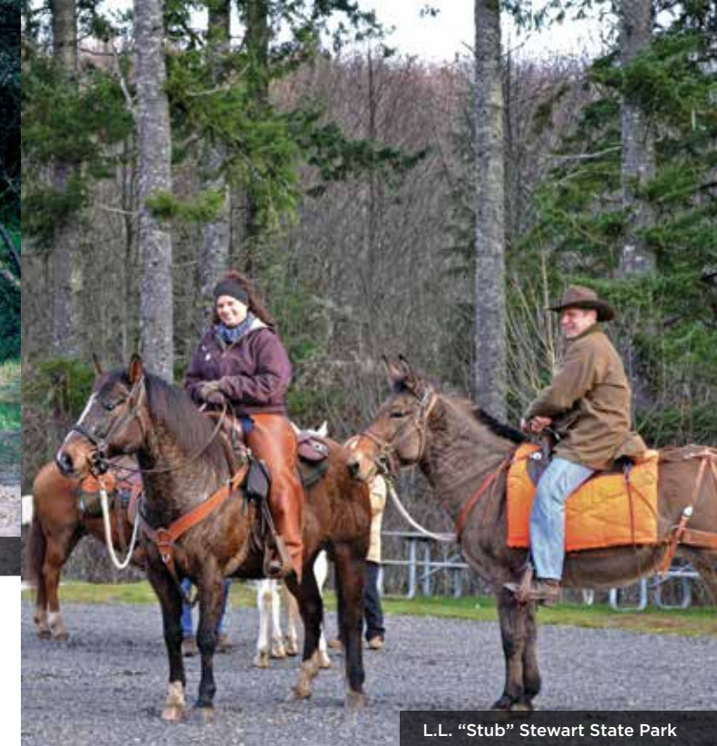
L.L. "Stub" Stewart State Park