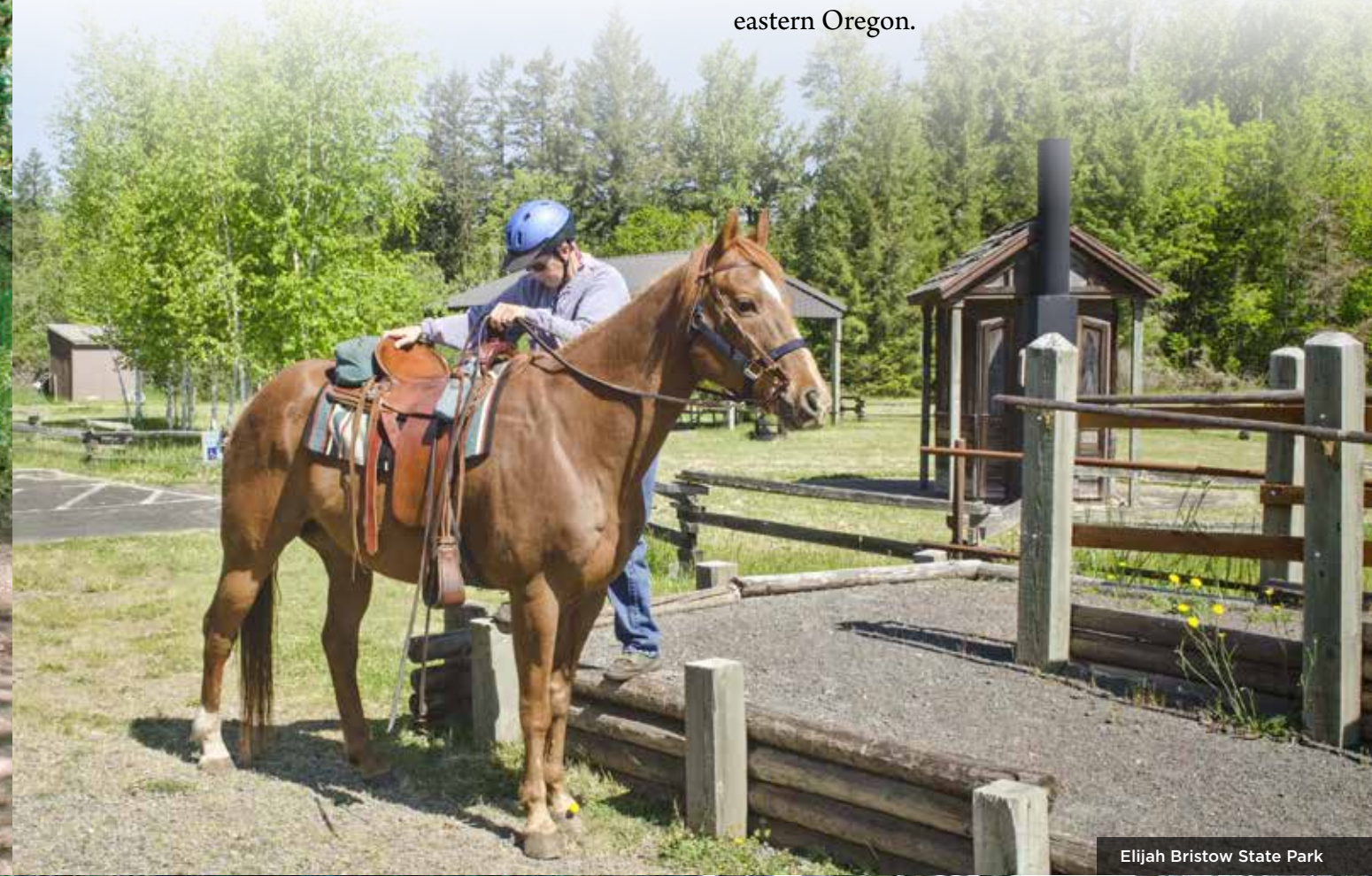
Elijah Bristow State Park