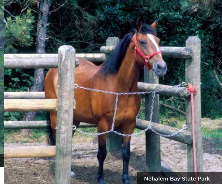
Nehalem Bay State Park